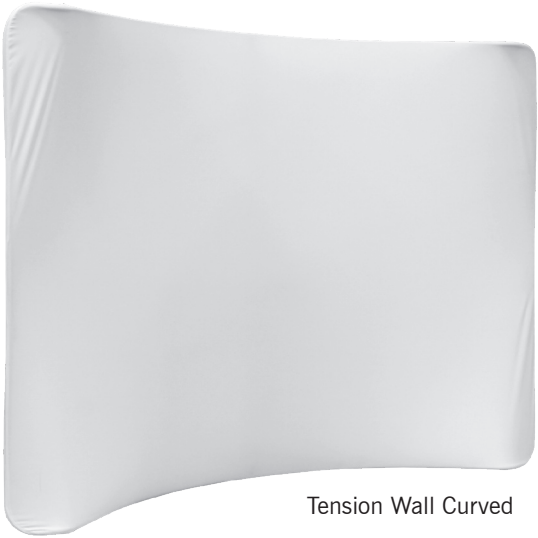
Tension Wall Curved