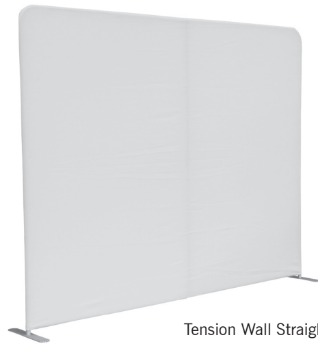
Tension Wall Straight